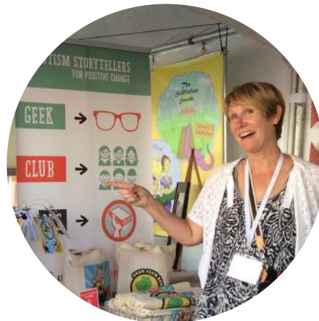
OC CHILDREN'S BOOK FESTIVAL

What you had to say was so interesting to me, and how you said it was amazingly fun . And FUN, unfortunately does NOT happen often enough at CalABA presentations."