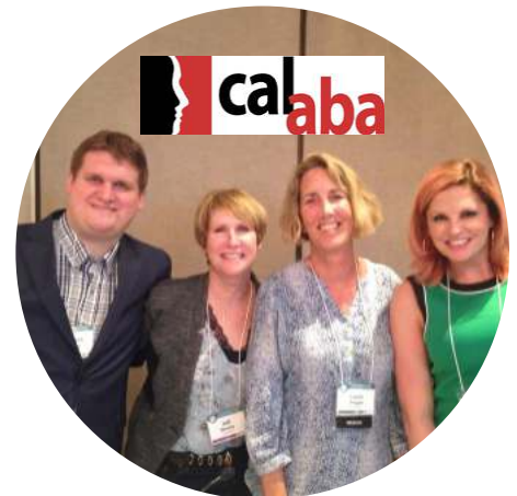
CALABA ANNUAL CONFERENCE